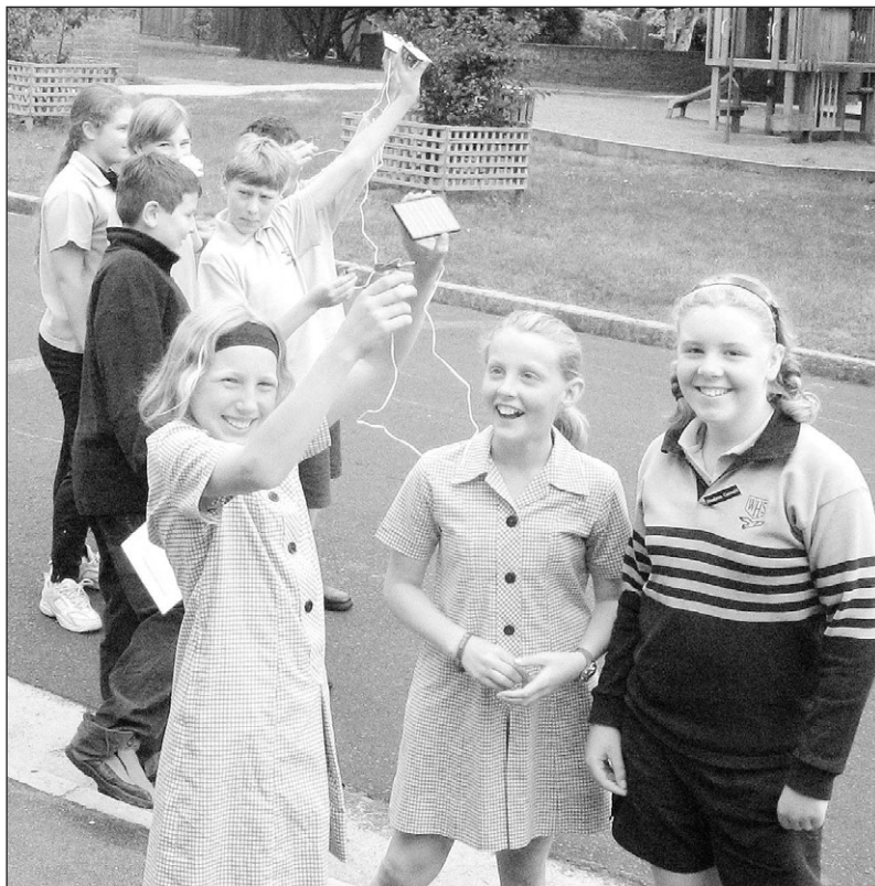
SKY-FI: Waimea Primary School students chase the sun with their solar panels.