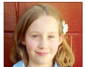
Lucy, Grade 5: Its good for the little kids because it won't be so far for them to walk.