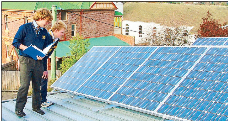
ALTERNATIVE POWER: St James Catholic College has installed Solar Panels to help reduce bills and minimise their global footprint.

St James College Grade 6 would like to thank to the Cygnet community for assisting us with this page. Thank you to all our sponsors.