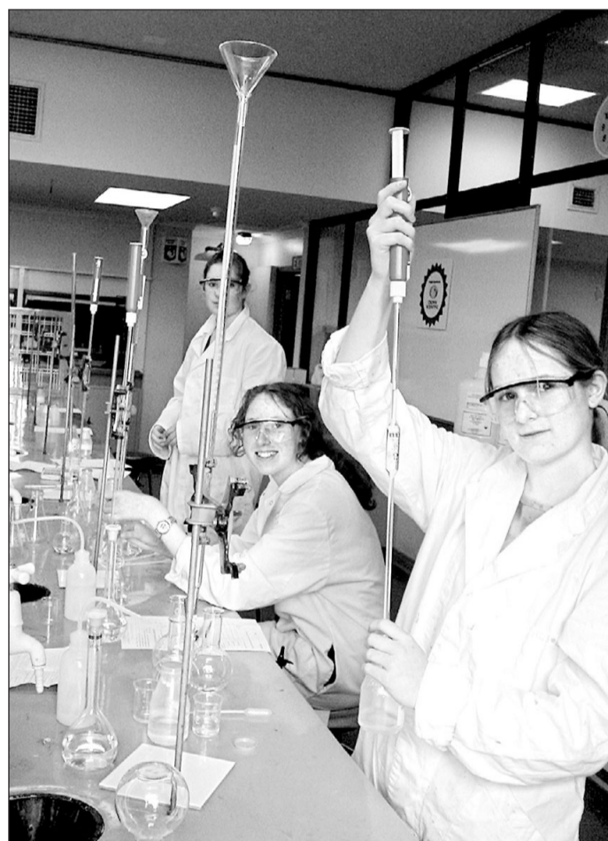
TEAM EFFORT: Rose Bay High students who took part in the titration competition.