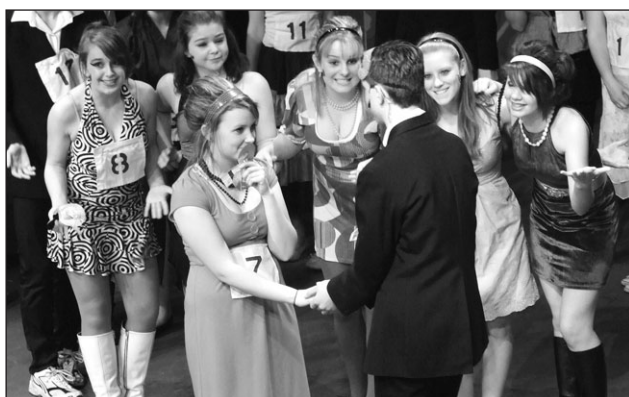
SHOWTIME: A scene from the musical production Alison.

THIS year's Rose Bay High School production was the world premiere of a new Australian musical called Alison on August 2 and 3.