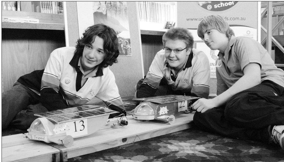
HANDS-ON PROJECT: Rose Bay High School students learn about solar energy.

Challenges that a school can take on include reducing waste and increasing biodiversity.