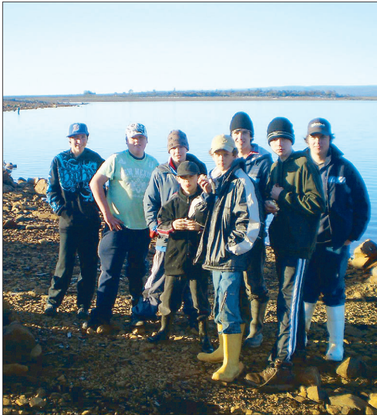
FUTURE: Personalised learning opportunities for students included a fly-tying business venture.

MOST Grade 10 students are yet to decide what career path they will choose, so the best way to help them decide is a work experience program.