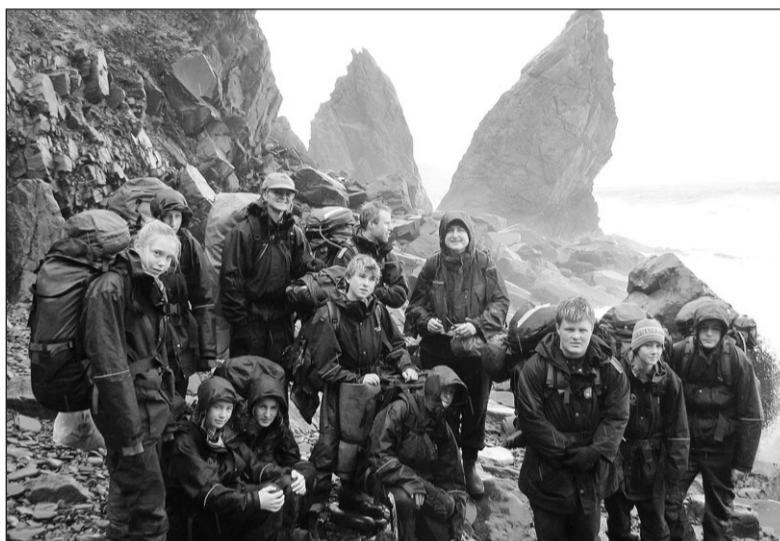
LEADERS: New Norfolk students on a Wilderness Project camp.

The program supplies all equipment the students and teachers need.