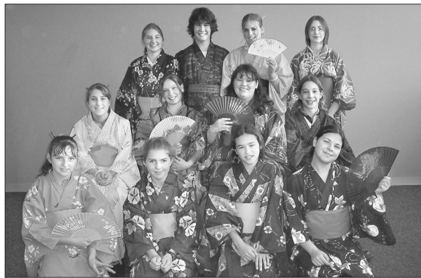
TRAVELLERS: Students bring back a taste of Japan to the school.

SIXTEEN students from Rose Bay High School journeyed to Japan for two weeks during the September holidays.