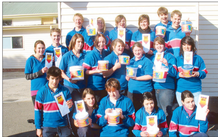
CAMBODIA-BOUND: Students are raising money to support a school in Cambodia.

Interested students and their parents attended a