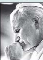
Pope John Paul II

Beatified by Pope John Paul II in Sydney on January 19, after the Vatican accepts she was responsible for the cure of a woman with terminal leukaemia in 1961.